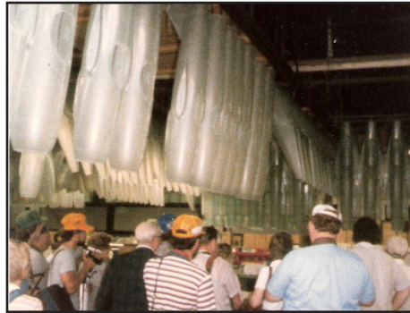
A shared photo from the Byron Original factory in the 1980's.

Many of our members most vivid memories are flying are quiet ones, flying with family or friends, at our home field. A few have attended the AMA NATs and other large contests or events over the years. A pilgrimage or two to the Aviation Expo in Iowa put on by Byron Originals still