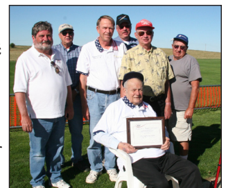
Propbuster members accept the AMA 50 year plaque in 2008.